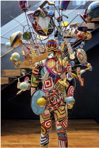
A staircase wraps around a sculpture by artist Nick Cave.

The first thing a visitor notices is that it's open, transparent and bold. I want the employees to feel creative without sensing barriers and I think that makes an enormous difference in what they bring to the table, in terms of ideas.