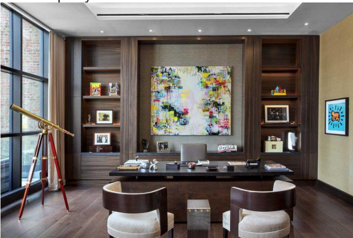
Perez says, “My office feels strong, gender-free and it’s edgy. I’m simple in style and this comes across in the color palette and in the actual setup.”