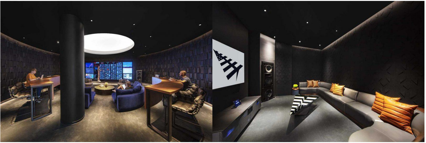
Toronto artist Ranbir Sidhu of FUTUREZONA designed the black and white paper airplane table.