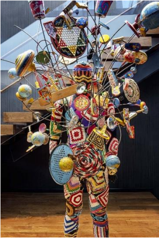
In the reception space on the sixth floor, a Sound Suit by Nick Cave stands sentry.