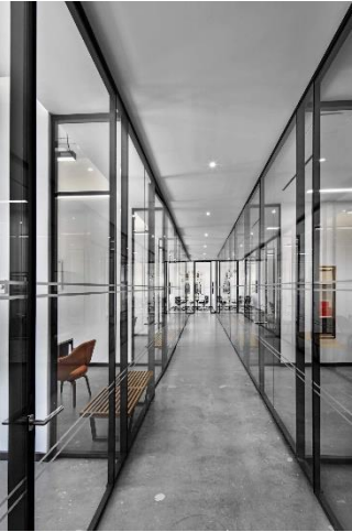
A series of offices along the corridor are fronted in Alea's A65 glass partition system.