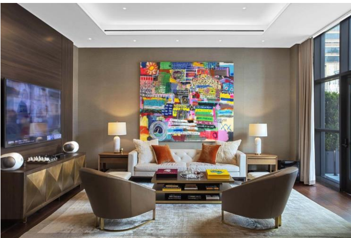
Basquiats are part of Jay-Z's extensive art collection.

Located in New York City's Chelsea neighbourhood, the 2,694-square-metre headquarters was designed by Jeffrey Beers International . It starts with a sophisticated ground-floor reception area in moody woods, metals and leathers. But the experience really kicks off on the sixth floor: the four office levels of Roc Nation extend from there to the rooftop. Exponentially brighter and more expansive, the sixth-floor reception is stylish yet comfy – a major theme throughout – with a black De Sede sofa atop a deep blue Reve rug and a floating glass staircase with walnut detailing. Next to the staircase: one of American sculptor Nick Cave's incredible Sound Suits. Just beyond are two photographic portraits by Mickalene Thomas.