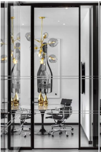
An office for Armand de Brignac Champagne, a Roc Nation brand.

Among the variety of interiors the firm crafted are a series of glass-wrapped offices for an executive of Armand de Brignac Champagne, a Roc Nation brand; a retail shop, for Roc Nation clothing label Paper Planes, featuring a grey marble counter and a custom-designed display system; and four executive offices (and meeting rooms) tailored to each exec's tastes.