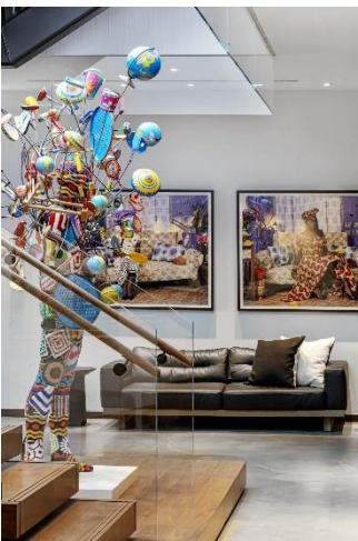
The area also features two photographic portraits by Mickalene Thomas.