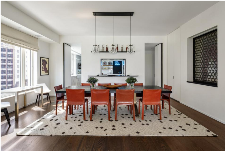
Spacious dining room EVAN JOSEPH STUDIOS