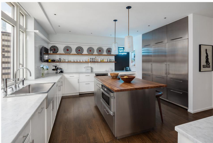
Professional-grade kitchen appliances

Located in the cultural nexus of New York City, 15 Central Park West is a coveted white-glove condominium building at the corner of West 61st Street and Central Park West. Amenities include full-time staff, a landscaped porte-cochère, garage, 14,000-square-foot fitness center, 75-foot sky-lit swimming pool, steam and sauna, private dining, wine cellar, library, business center, private screening room, meeting space, game room, outdoor terrace and children's playroom.