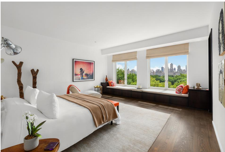
All rooms have wide plank flooring.