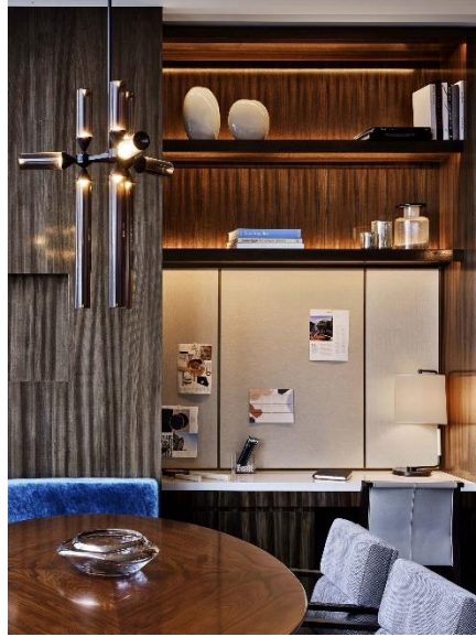
Hidden by a sliding door, an office nook is cleverly placed in a unit at One 57 in Manhattan designed by Jeffrey Beers.

that can easily stow away when they need to be out of site. “This consists of a mobile desk on casters with filing units on wheels, laptop storage with cable management, mobile screens, et cetera.”