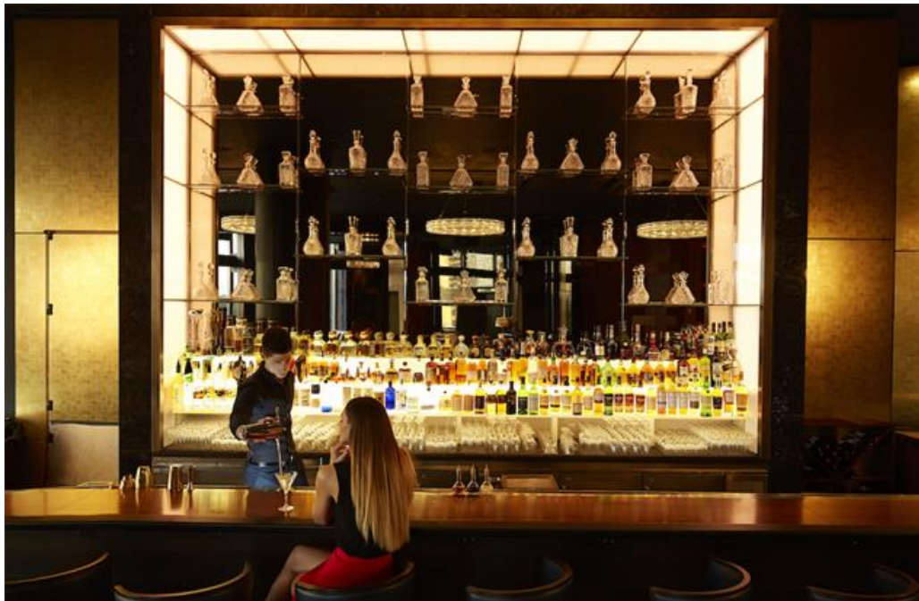
Ascent Lounge, New York City