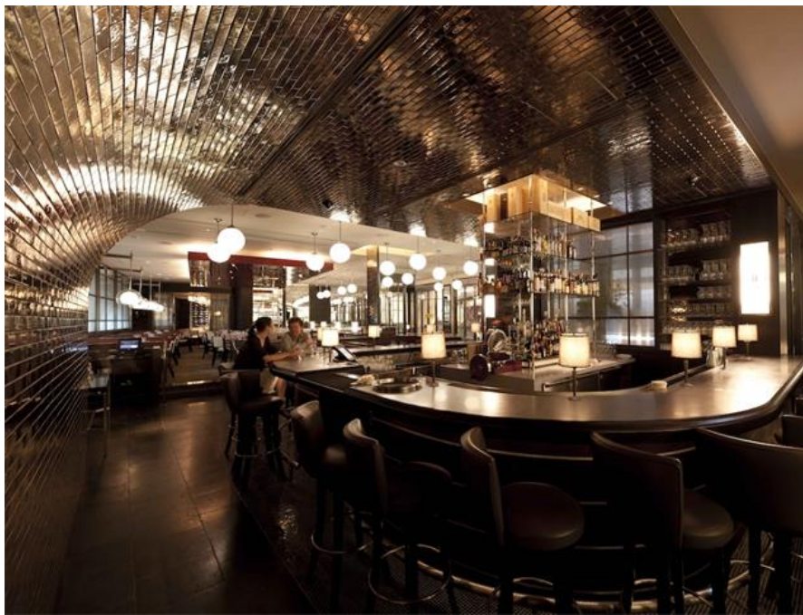
Chef Daniel Boulud's db bistro and oyster bar in Singapore.