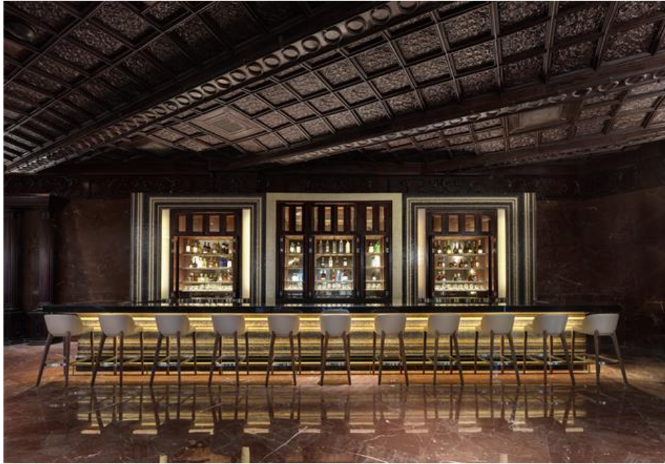
El San Juan's Gold Bar, in El San Juan Hotel, Puerto Rico.