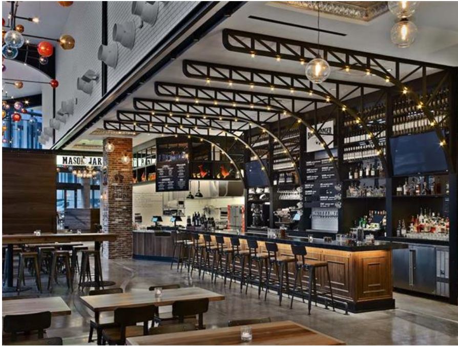
Gotham Market at the Ashland Hotel, New York.