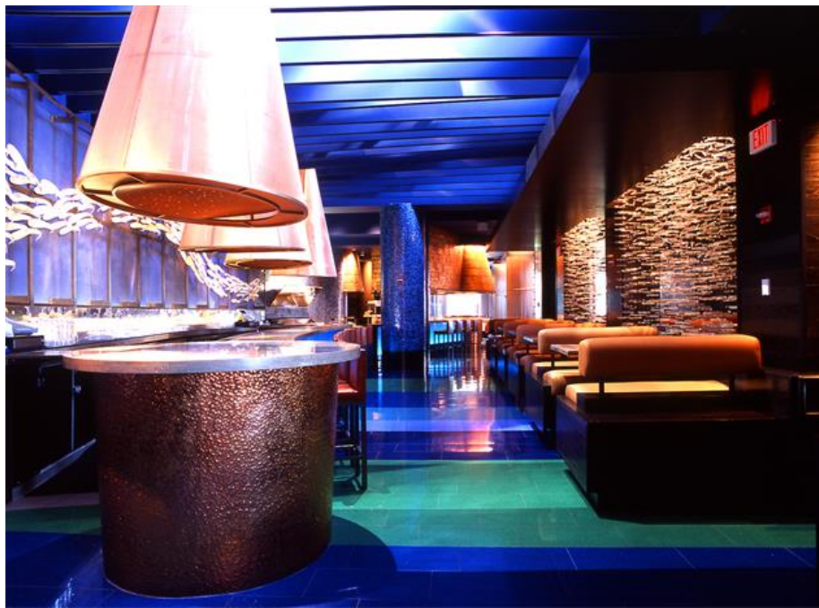
Chef Todd English's Blue Zoo, in the Dolphin Hotel in Disney World.