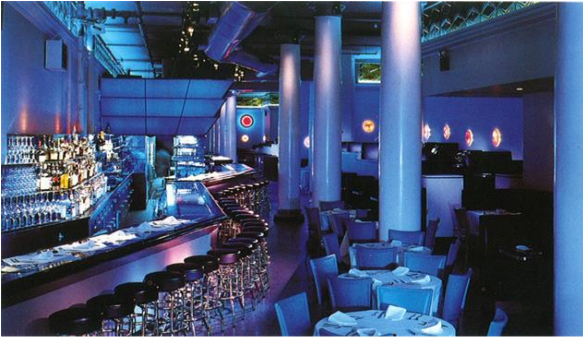
Bar Lui, way back in 1985.