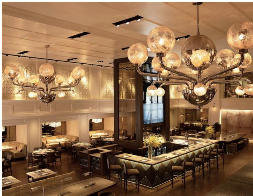
Park Central Hotel, New York.