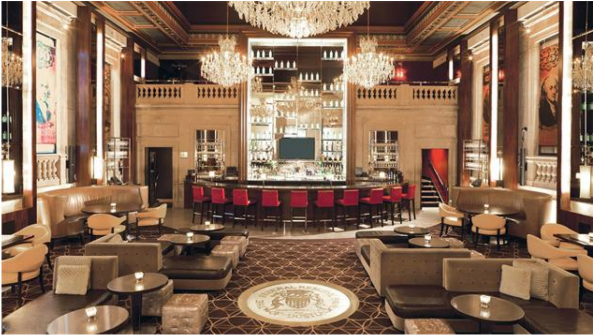
Bond, in the Langham Hotel in Boston.