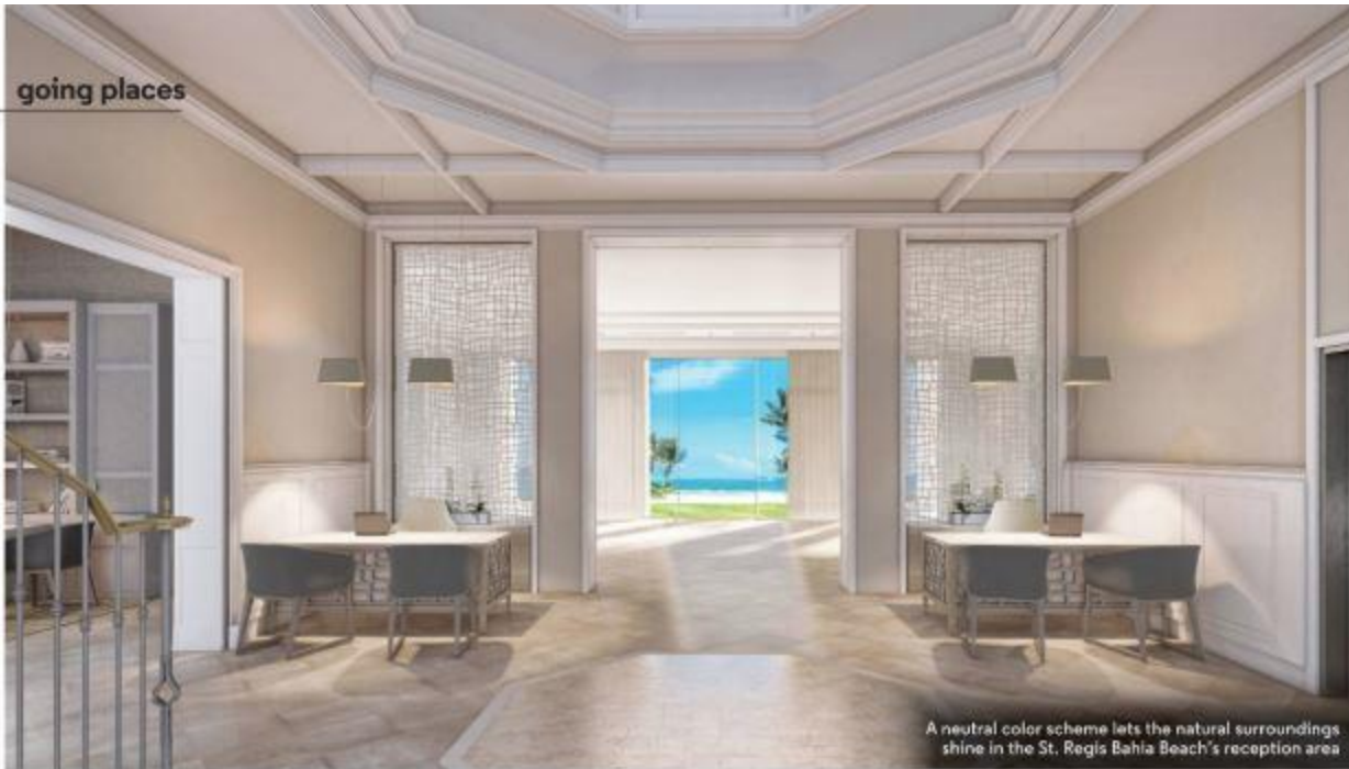
A neutral color scheme lets the natural surroundings shine in the St. Regis Bahia Beach's reception area