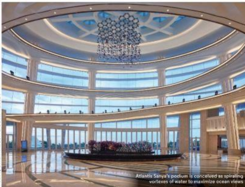
Atlantis Sanya’s podium is conceived as spiraling vortexes of water to maximize ocean views