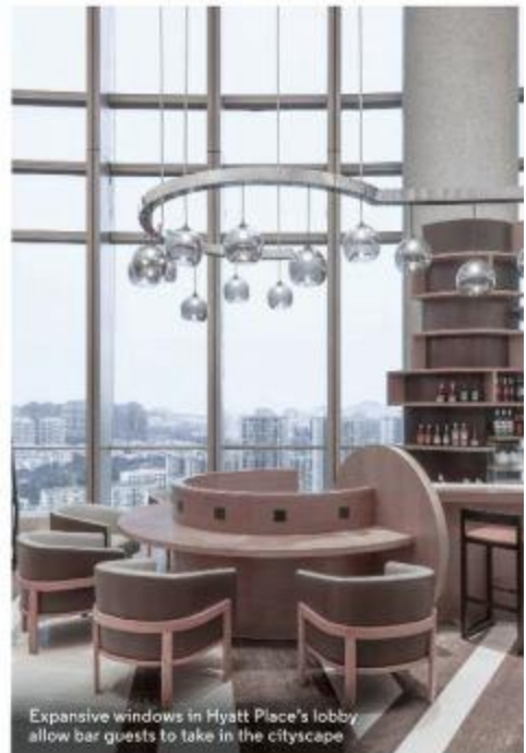
Expansive windows in Hyatt Place’s lobby allow bar guests to take in the cityscape