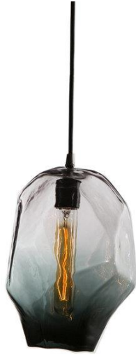
Geo Pendant Light, Esque Studio