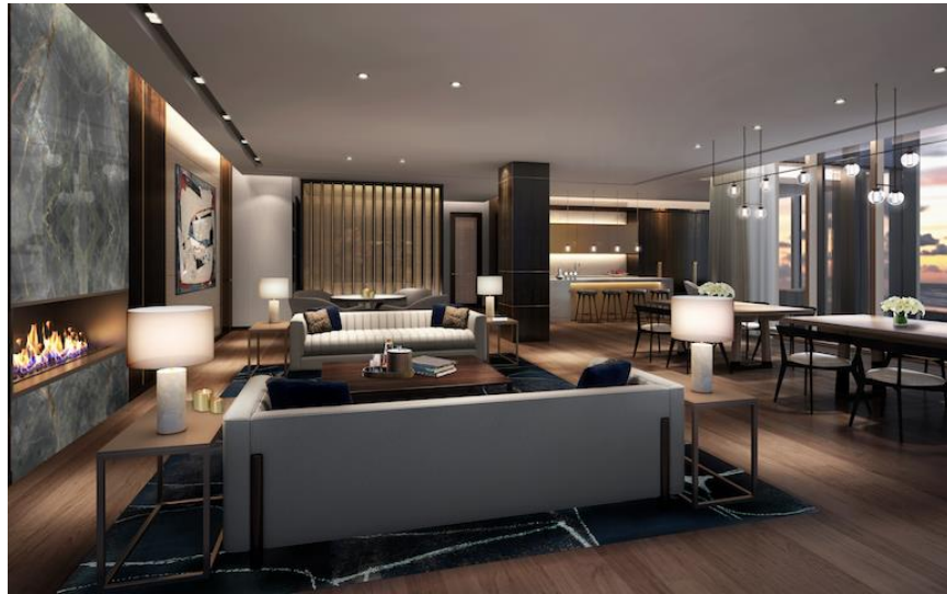
The sky lounge at 133 Seaport by Jeffrey Beers International.