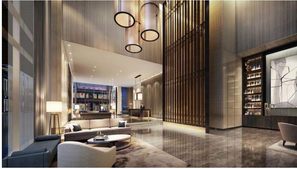
The lobby at 133 Seaport by Jeffrey Beers International