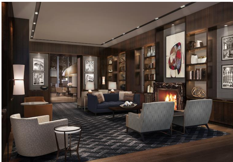
The library at 133 Seaport by Jeffrey Beers International.