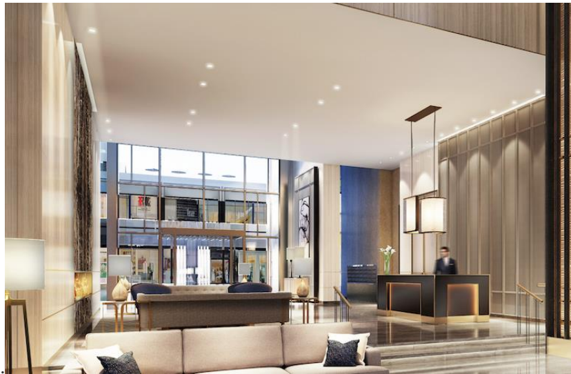
The lobby at 133 Seaport by Jeffrey Beers International.