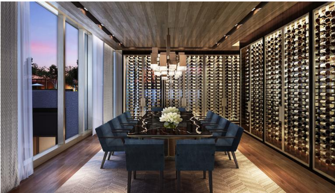
The wine room at 133 Seaport by Jeffrey Beers International.

Boston's EchelonSeaport , a luxury residential complex, won't be completed until next year, but new renderings give an early look at the interiors designed by Jeffrey Beers International . The complex will consist of three towers, anchored by a central courtyard, that encompass a whole city block in the Seaport District. JBI will shape over 60,000 square feet of amenity spaces, including lobbies and lounge areas, indoor fitness areas, and a sky lounge in each tower. The design channels Boston's timeless American style and Beers' experience in the luxury hospitality industry. Other members of the architectural team include Kohn Pedersen Fox and local firm CBT Architects, who collaborated on the exterior. Regent Hotels & Resorts will provide luxury services to the condominiums, and the developer is Cottonwood Group. Construction is expected to be completed by 2020.