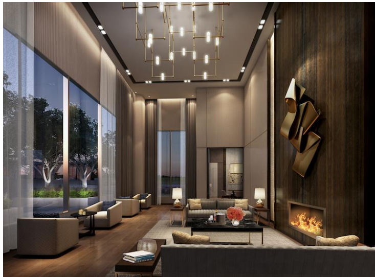
The fireplace lounge at 133 Seaport by Jeffrey Beers International.