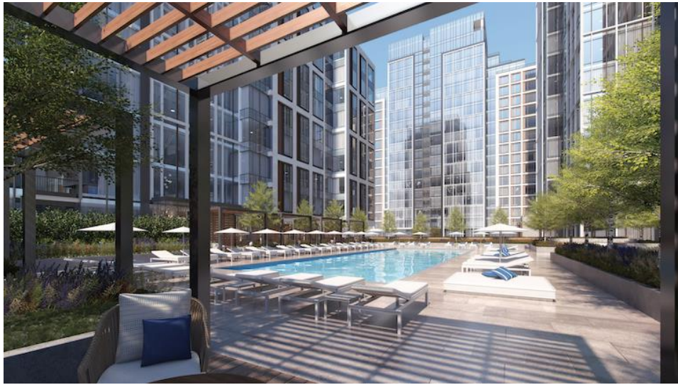
The grand pool at EchelonSeaport by Jeffrey Beers International.