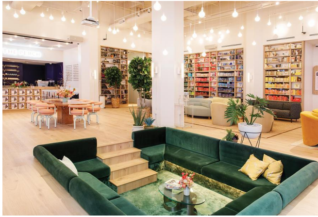
The Wing in Brooklyn's Dumbo neighborhood