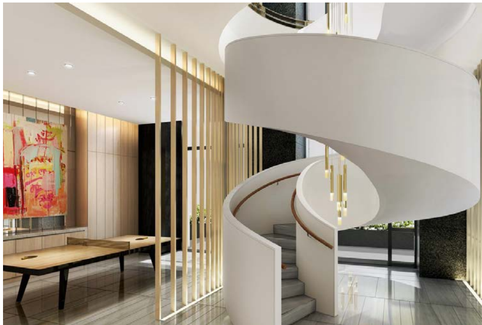
A spiral staircase that leads to the game lounge, which comes with a custom ping pong table.