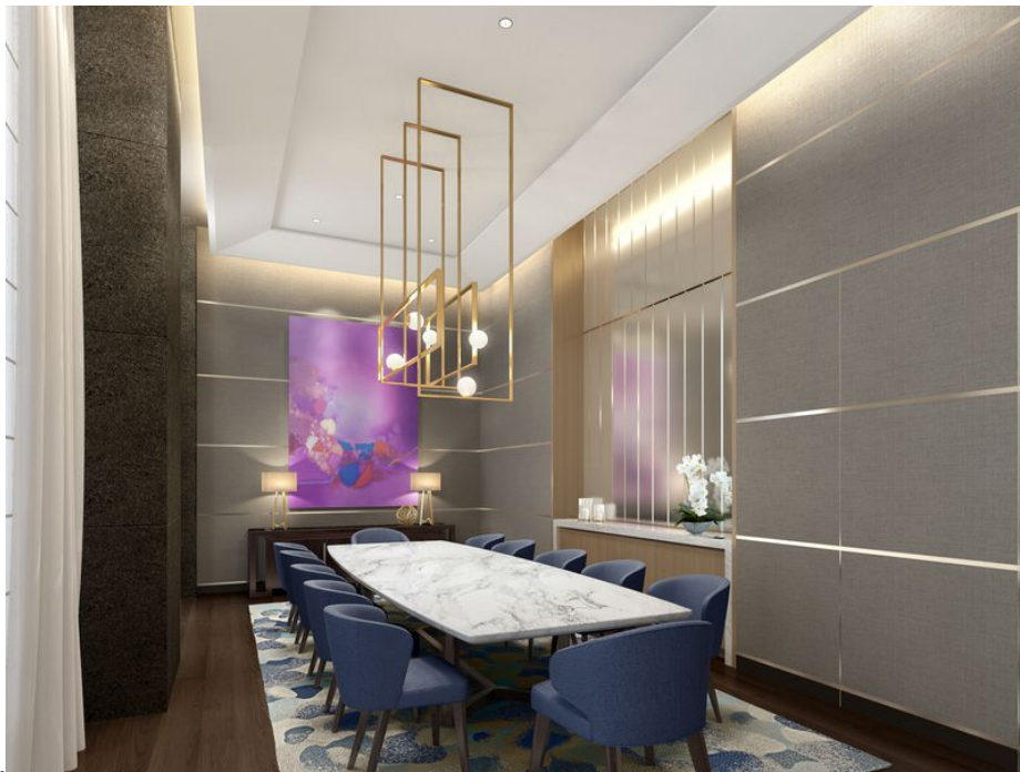
The entertainment suite.