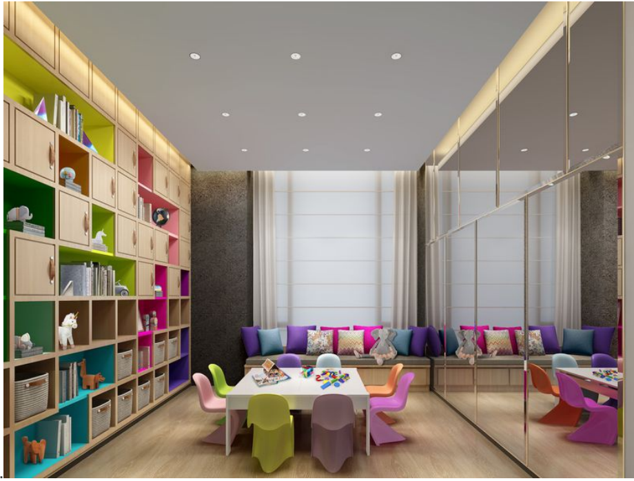
The children's playroom