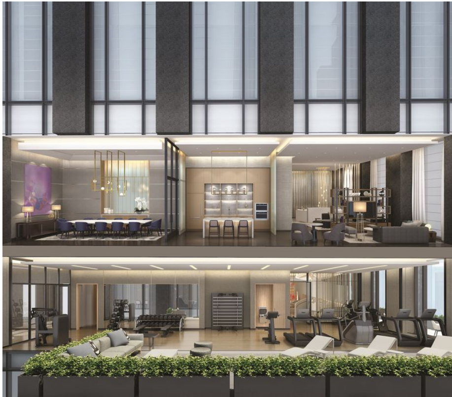
An overview of the two-level amenity spaces at 277 Fifth Avenue.

277 Fifth Avenue is currently under construction, and when complete, the building will stand 55-stories tall, and bring 130 new condos to Nomad. Sales launched in September last year with apartments asking from $1.905 million. The first of residents are expected to move in later this year.