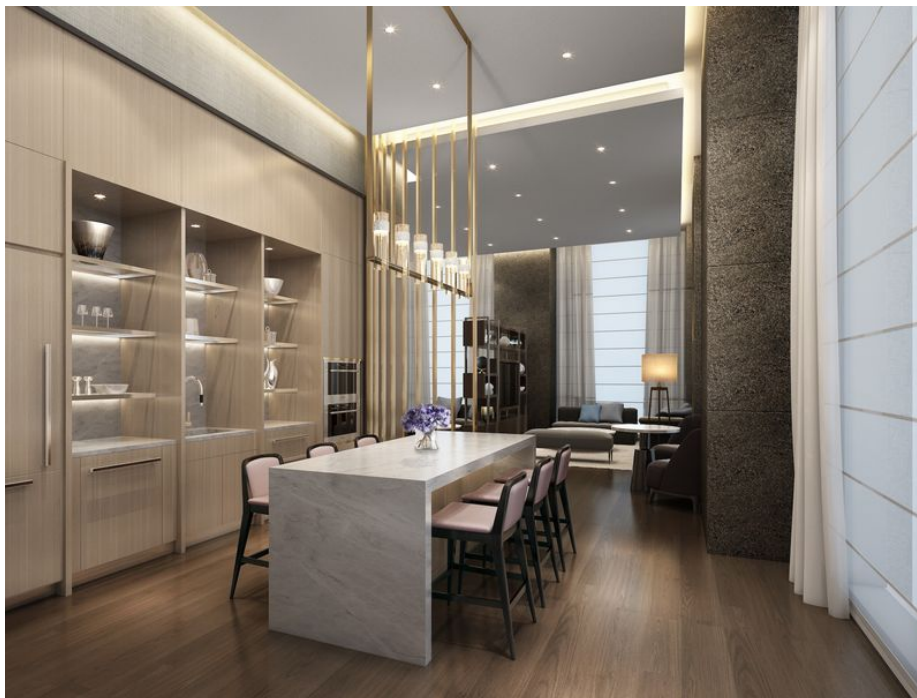
The bar and pantry area.