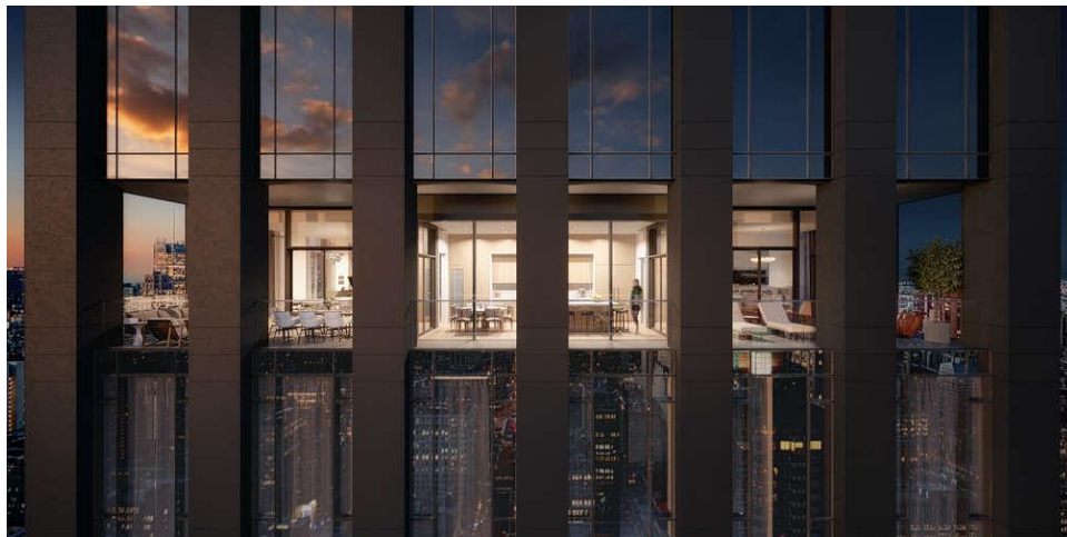
277 Fifth Avenue

By CityRealty Staff Friday, July 19, 2019