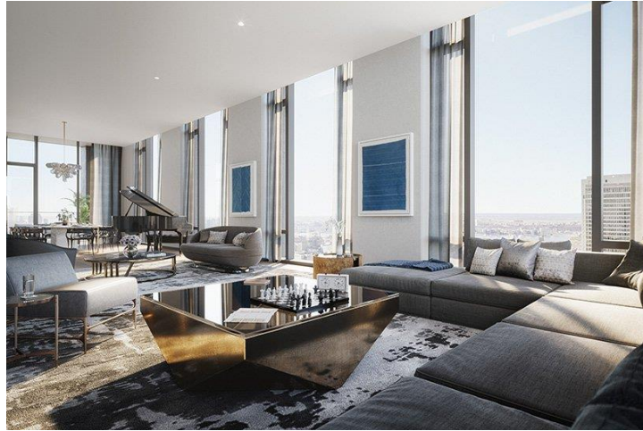
open plan living configurations are found throughout image by three marks

resident amenities comprise a lobby library with a double-height bookcase wall, an entertaining suite with separate bar and kitchen pantry, a private dining room, and a games lounge. a fitness club with separate training/yoga studio as well as men's and women's spa with steam/sauna rooms is also included. the full-service residences will also include private storage, bike storage, a pet priority program, a dry cleaning program and vehicle concierge, as well as full-time doormen.