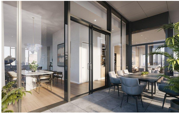
outdoor space is also provided