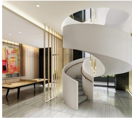
the sculptural staircase in the building's gym