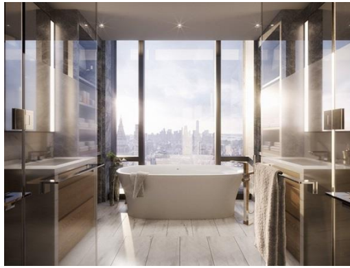
bathrooms offer downtown views