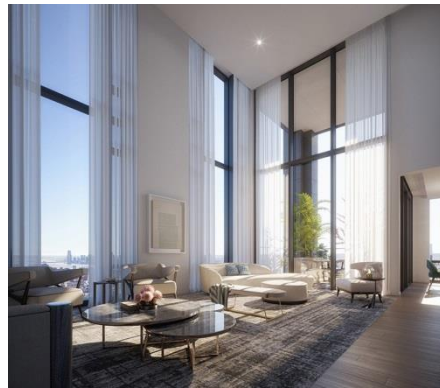
expansive living, dining, and family rooms are found throughout image by three marks