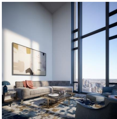
ceiling heights are in excess of 13 feet image by three marks