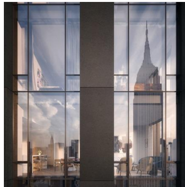
condominiums offer sweeping views across the city