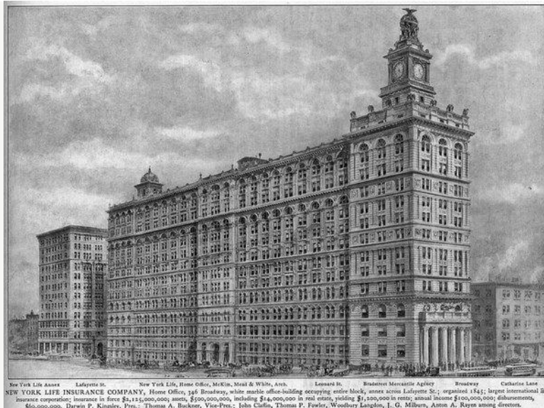
A historic depiction of the building when it was headquarters for New York Life Insurance.

Meanwhile, work continues. The exterior restoration firm HLZA used nylon brushes to scrub the facade of the building, which extends east to Lafayette Street, south to Catherine Lane, and north to Leonard Street, where the building’s main entrance will be. They replaced damaged portions of the roof parapet, repaired scars left after old metal fire escapes were removed (in favor of new code-compliant staircase cores) and restored the fierce-looking 7,000-pound eagles that perch on the roof.