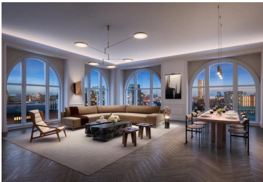
In the great rooms of most apartments, tray ceilings with cove lighting will make high ceilings seem even higher. Credit Rendering by DBOX

Inside, on the ground level, restoration has just begun and will include the removal of paint that at some point had been slathered all over marble columns and pilasters.