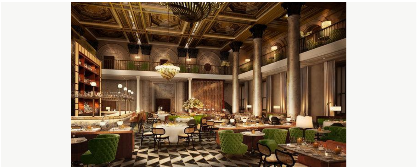
The former banking hall is being marketed as a restaurant or event space.