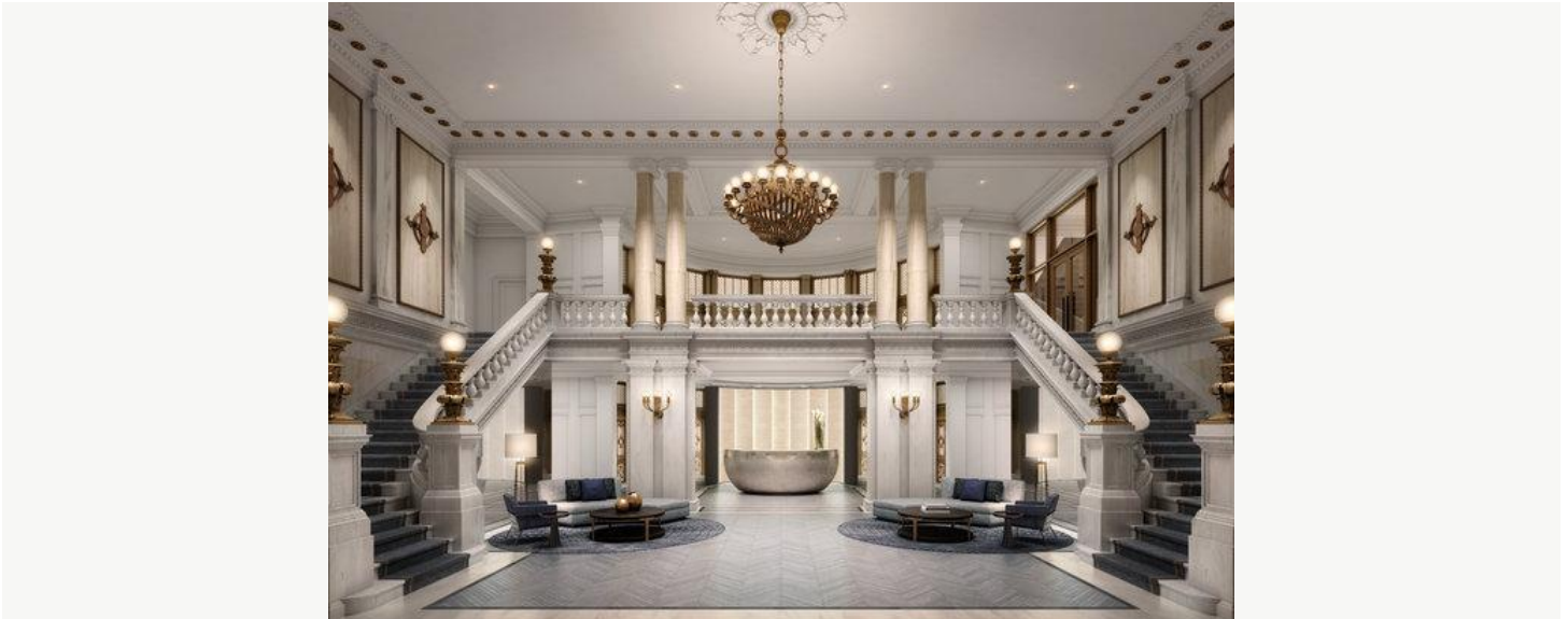
The Leonard Street entrance to the building will lead to a double-height lobby. Credit Rendering by DBOX

Under city law, an interior landmark is supposed to be open or accessible to the general public regularly. But the ante room and some other interior landmark spaces will only be open to residents.