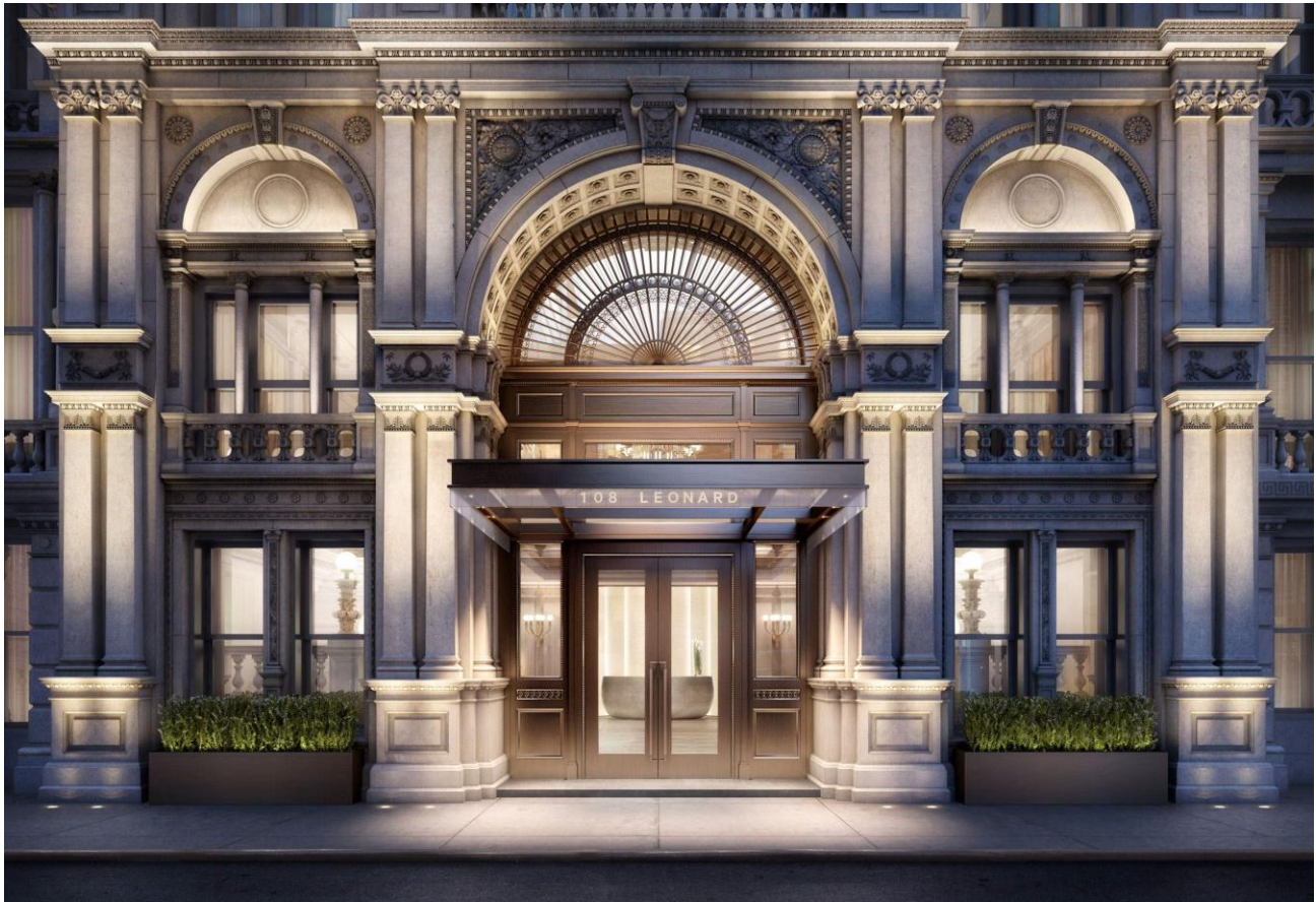
108 Leonard, 108 Leonard St., Tribeca