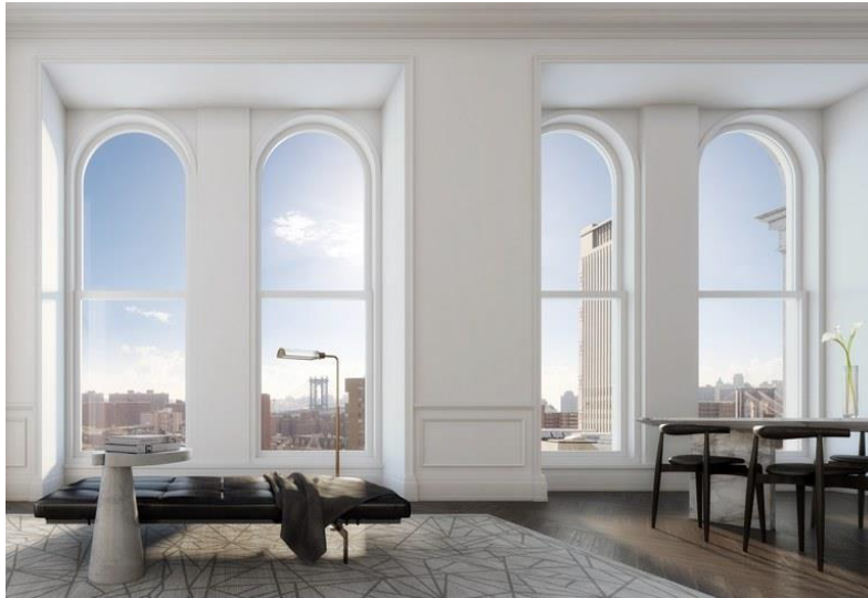
And interior rendering of a unit with tall, rounded windows. Image: DBOX