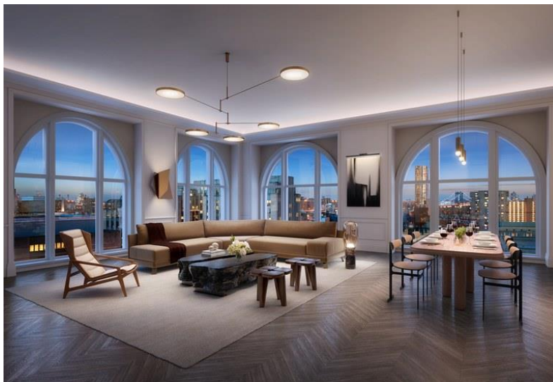
The 9-to-14-foot-high ceilings in 108 Leonard allow cove lighting in the residence great rooms.