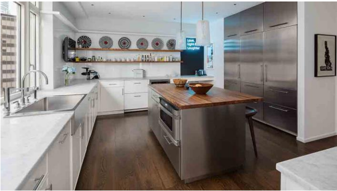
The kitchen was completely redesigned.