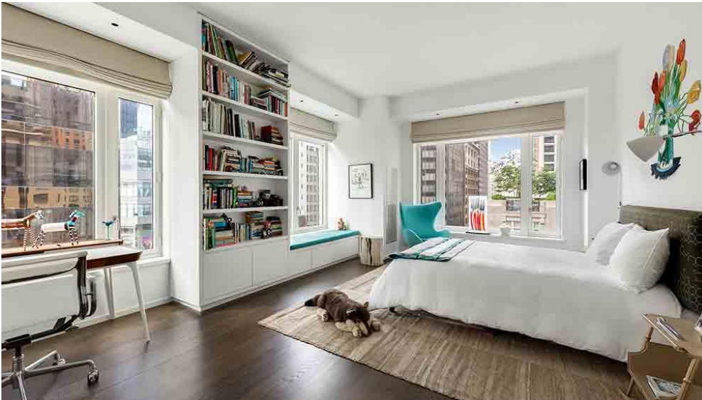
One of four bedrooms in the condo