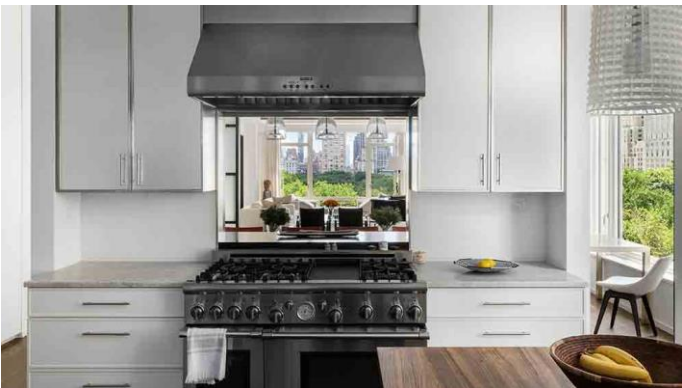
The Thermador cooktop