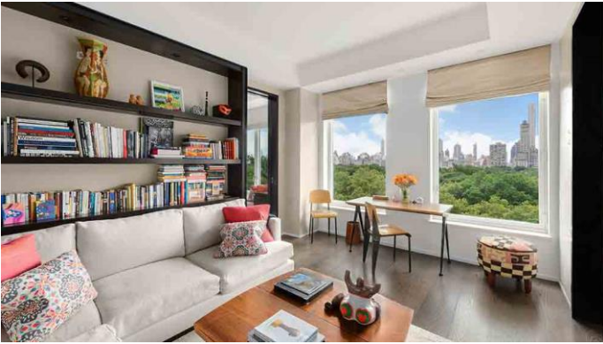
The library also has stunning views of the park.