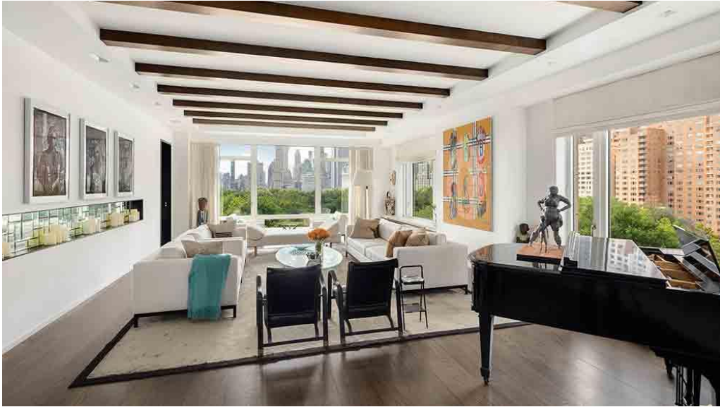
The spacious living room

The chef's kitchen was redesigned to highlight views of Central Park and includes premium appliances, such as a Sub-Zero refrigerator and wine cabinet, two Miele dishwashers and a six-burner Thermador cooktop with dual ovens, grill and griddle. The island and shelving are finished with solid zebrawood.