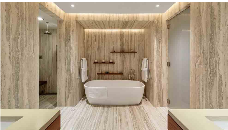
That incredible silver travertine

https://robbreport.com/shelter/homes-for-sale/35-million-central-park-west-condo-jeffrey-beers-1234589181/