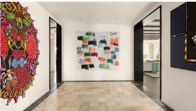
The gallery space off the foyer