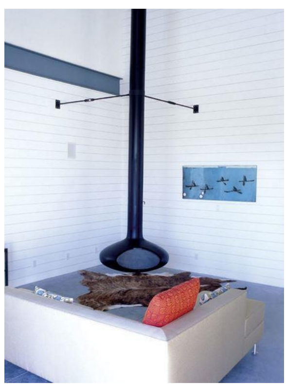
Painted white plank walls and a floating fireplace create a modern minimalist vibe in this Sagaponack home designed by architect Mark Zeff. ERIC LAIGNEL 5/5