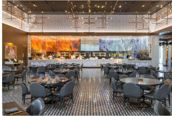
Gordon Ramsay Hell's Kitchen

Ramsay just celebrated the restaurant's first year with plans to film the next two seasons of Hell's Kitchen inside the restaurant.