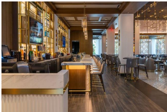
The view of Gordon Ramsay Hell's Kitchen from the entrance