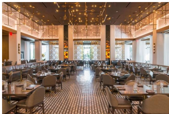
The dining room at Gordon Ramsay Hell's Kitchen

https://vegas.eater.com/2019/3/14/18259555/gordon-ramsay-hells-kitchen-eater-awards-2018