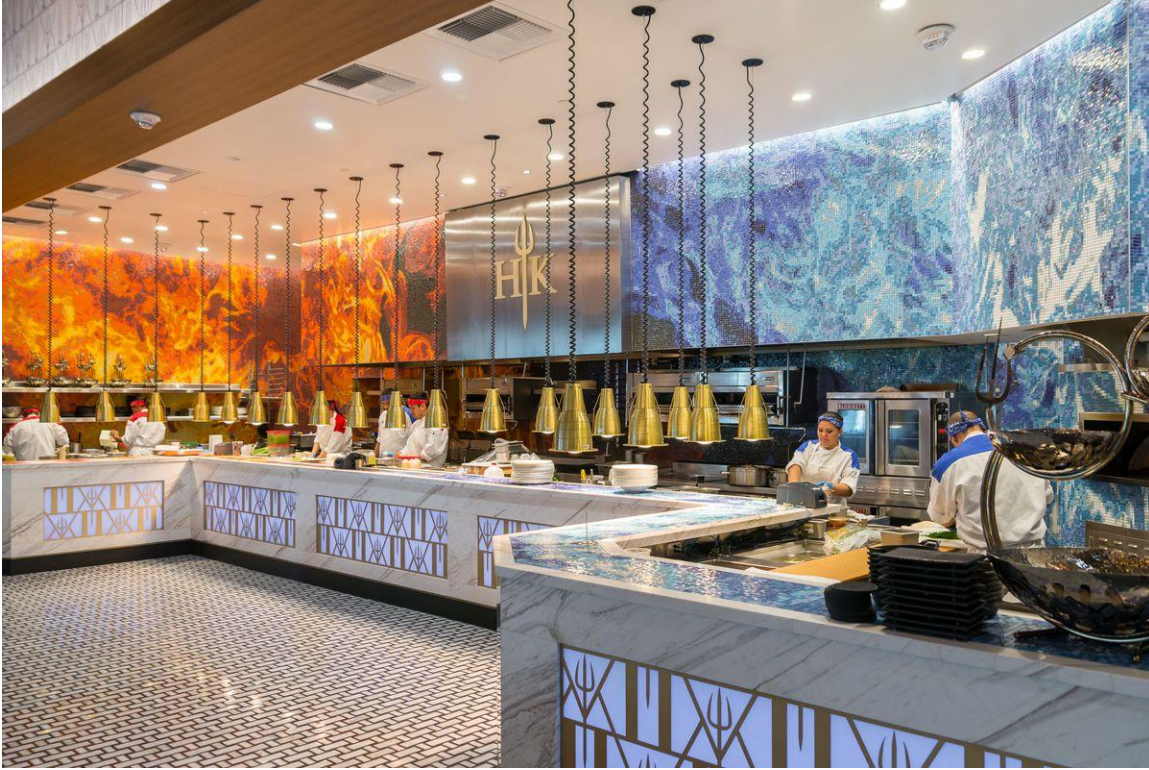
The kitchen at Gordon Ramsay Hell's Kitchen

Television personality Gordon Ramsay's fifth Las Vegas pays tribute to his long-running Fox show Hell's Kitchen . Gordon Ramsay Hell's Kitchen at the front of Caesars Palace takes an 8,000-square-foot space and makes it into an homage to his show, entering its 19th season.