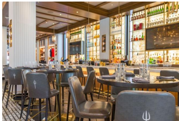
The bar at Gordon Ramsay Hell's Kitchen