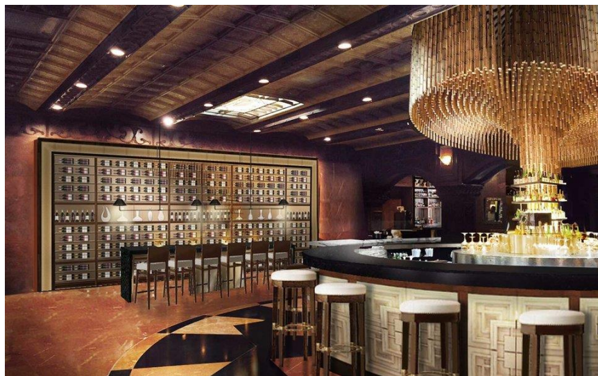
The renovated El San Juan Hotel will have 15 watering holes, including this new wine bar.