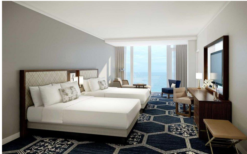
The redesigned Tower Rooms in the new El San Juan Hotel.