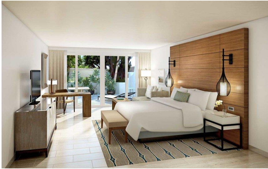
The redesigned Ocean Rooms at El San Juan Hotel.