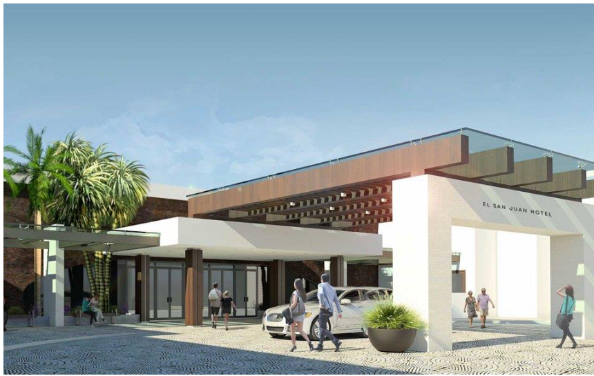
The new porte cochère entrance to El San Juan Hotel designed by Jeffrey Beers.