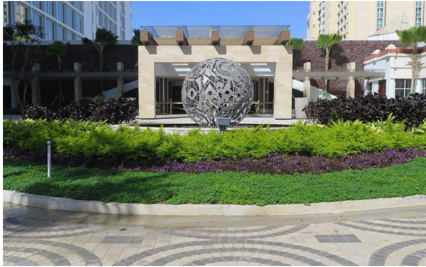
Local artist Luis Torruella was commissioned to create a custom sculpture, an eight-foot sphere that floats in a shallow pool near the hotel entrance.