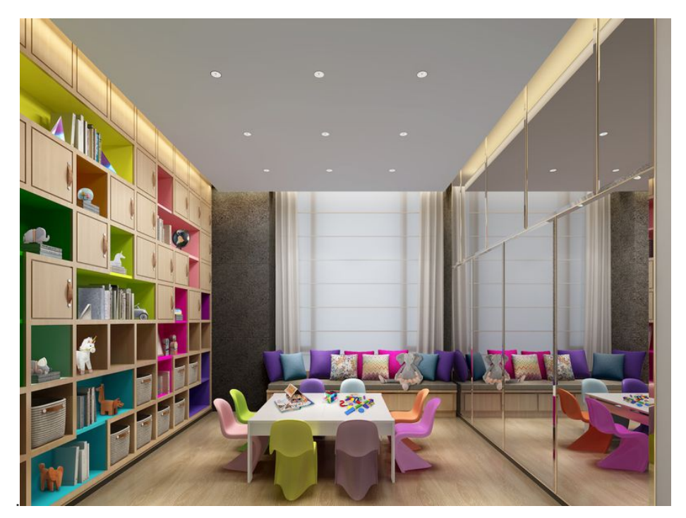
The children's playroom