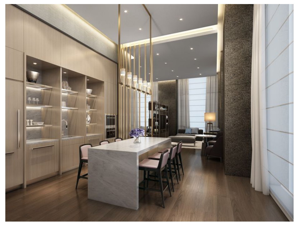
The bar and pantry area.