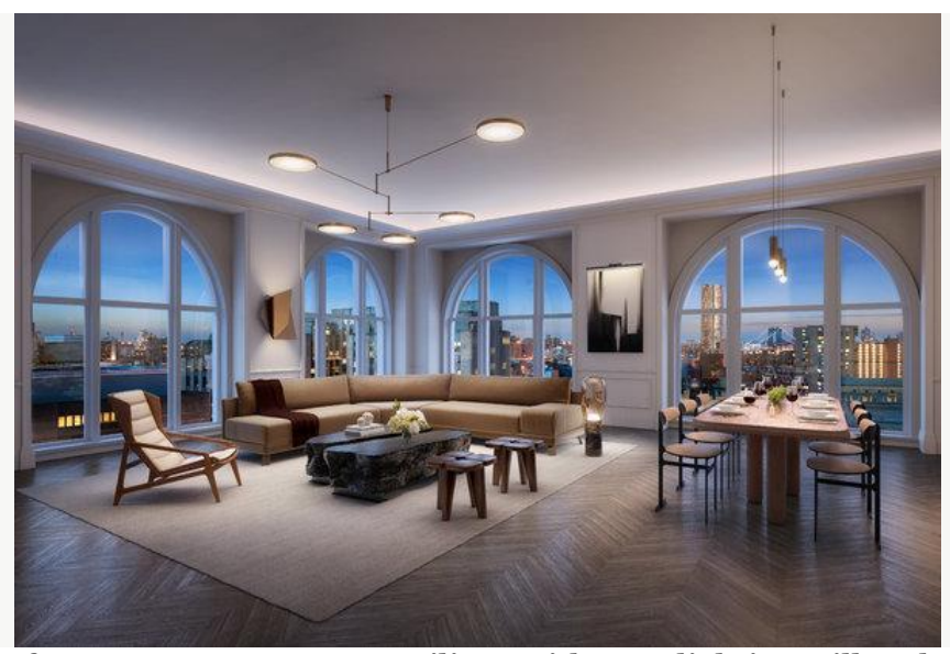
In the great rooms of most apartments, tray ceilings with cove lighting will make high ceilings seem even higher. Credit Rendering by DBOX

Inside, on the ground level, restoration has just begun and will include the removal of paint that at some point had been slathered all over marble columns and pilasters.