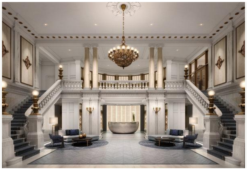
The Leonard Street entrance to the building will lead to a double-height lobby. Credit Rendering by DBOX

Under city law, an interior landmark is supposed to be open or accessible to the general public regularly. But the ante room and some other interior landmark spaces will only be open to residents.