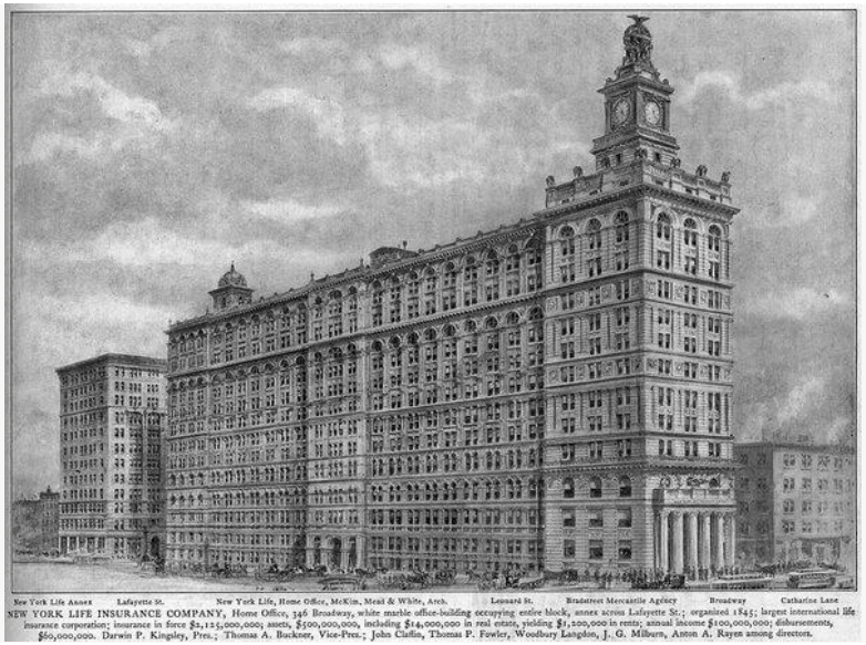
A historic depiction of the building when it was headquarters for New York Life Insurance.

Meanwhile, work continues. The exterior restoration firm HLZA used nylon brushes to scrub the facade of the building, which extends east to Lafayette Street, south to Catherine Lane, and north to Leonard Street, where the building's main entrance will be. They replaced damaged portions of the roof parapet, repaired scars left after old metal fire escapes were removed (in favor of new codecompliant staircase cores) and restored the fierce-looking 7,000-pound eagles that perch on the roof.